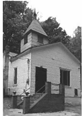
Mt. Pleasant Baptist Church near Lucketts