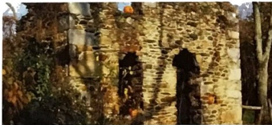
Aldie Mill, top, and Potts-Neer Mill close to Hillsboro.

While you cannot sign up for individual classes, you may enroll for one semester. The fee for this series is $250 per person for both the spring and fall sessions, or $150 for either one. Proceeds benefit the education programs of Aldie Mill Historic Park, a NOVA Parks property. Cost includes course materials. To keep tuition modest, class participants provide transportation.