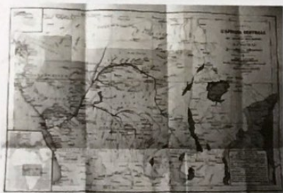
Lt. Emory Taunt's map

resident diplomat in equatorial Africa, who died in 1891 along the Congo River. His life and times at the end of the 19th century open a window today on the tragic history of this deeply troubled region.