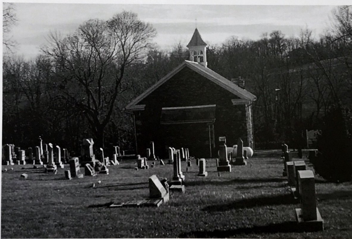
The cemetery at Mount Olivet Methodist Church on Mountain Road near Lovettsville is the burial ground of four 918 victims of the “Spanish Flu.”

No influenza vaccine existed until 1942, the classification of “H1/N1” was far off in the future and indeed, even “virus” was a vague concept before 1935. Covid-19 and the 1918 Influenza have many differences both biologically and socially, but it is déjà vu all over again in a larger sense that all pandemics arise from crowding and a novel pathogen for which there's no prior immunity.