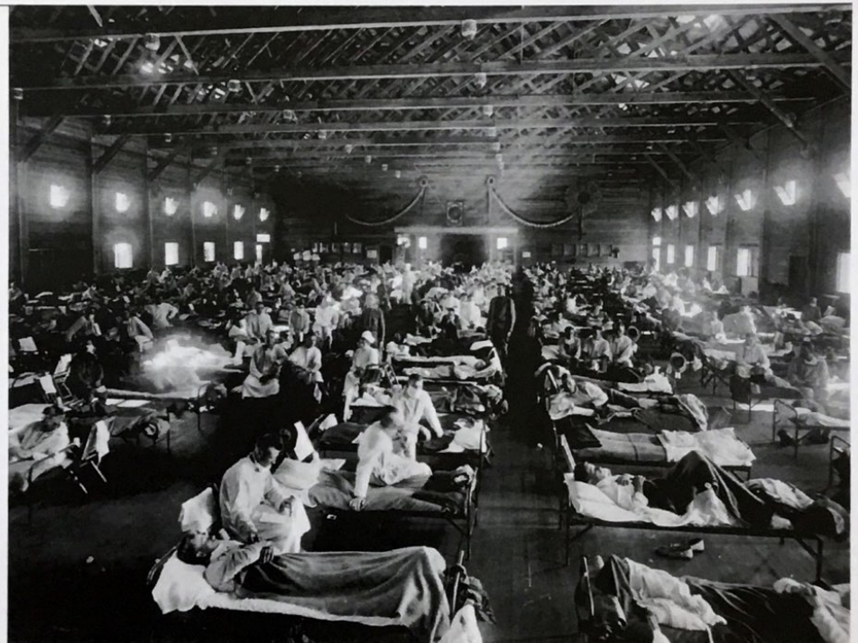
Cautionary poster published in national newspapers, above left; patients and nurses in infirmary, above; below, then-Senator Warren G. Harding announces campaign to fight influenza.