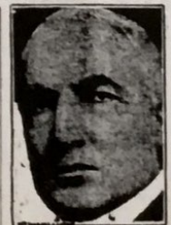
SEN. WARREN G. HARDING

Letters and telegrams by the thousands are coming to members of both houses urging them to work for and