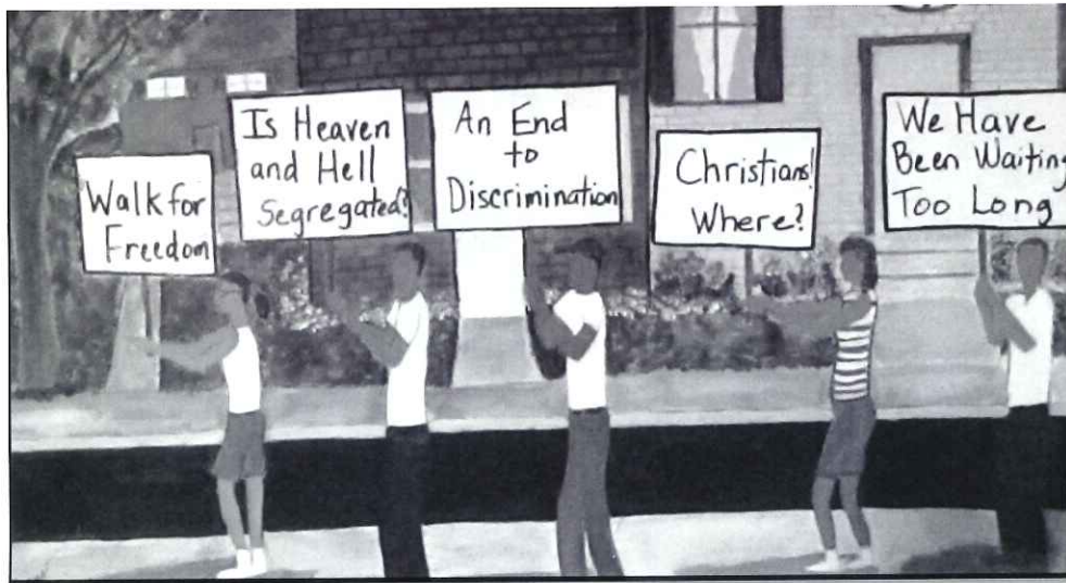
Poster from the Gertrude Evans Collection at Thomas Balch Library.

Established in 2000 , the Black History Committee is dedicated to preserve, collect, and share the history of African Americans who have contributed to the emergence and development of Loudoun County, Virginia. During the past 16 years, it has recorded oral histories and produced numerous publications, including, "A Glimpse into Loudoun County's African American Histories," a Virginia Standards of Learning teaching aid, and "African American Historic Communities: A Tour Map and Guide" on which our two successful bus tours of these prominent communities is based.