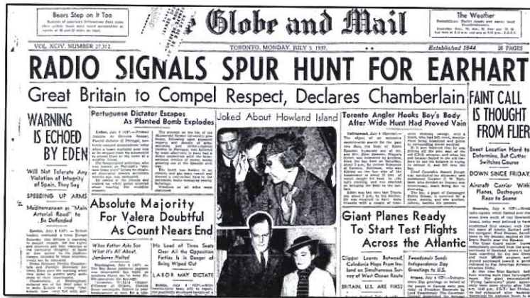
One of thousands of documents now available to Balch researchers with new database subscriptions made possible by a grant from the Friends.

That's why an institution such as the Thomas Balch Library can't be put in an isolated box. Rather, it stands as an open door to research and new horizons.